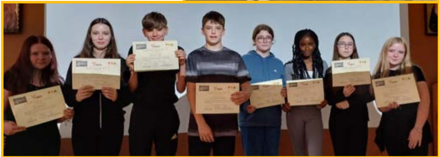
YBA pupils performed their drama work alongside their new Greek friends, and they were presented with certificates of participation at the end.