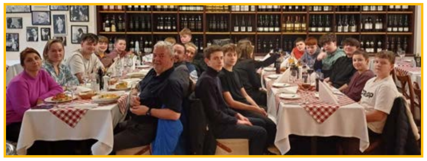
After completing their collaborative final performance they had a lovely meal out with all involved with the project.