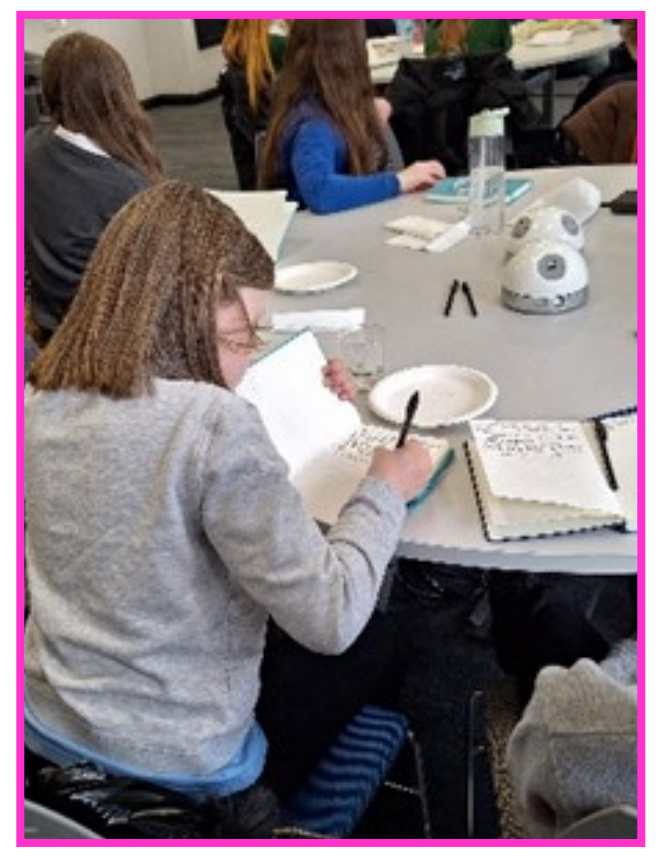
A pupil busily writing in her journal